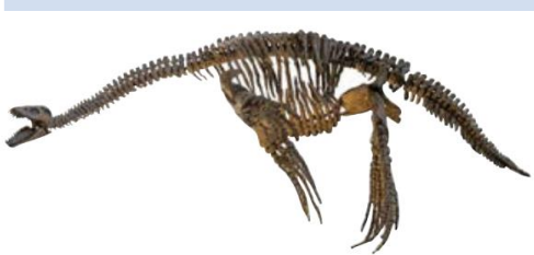
fossilised Plesiosaur skeleton

Mary Anning (1799–1847) was an English fossil collector. She lived in Lyme Regis in Dorset, in an area now known as the Jurassic Coast. Mary had little formal education but was taught fossil hunting by her father. She made many important fossil discoveries during her lifetime, including an Ichthyosaur fossil in 1811 and a fossilised Plesiosaur in 1823.