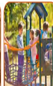
recreational land Land which has buildings providing fun activities.