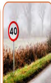
transportation A way of getting something from one place to another.