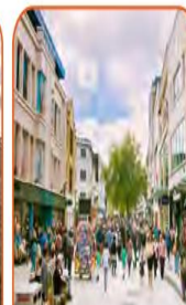
commercial land Land used for buildings aimed at making money.