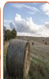
agricultural land Land used for farming, cattle and crops.