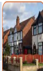
residential land Land used for houses and apartment blocks.